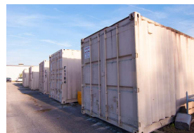
Transportation and Warehousing